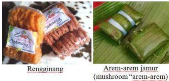
Figure 3. The examples of flamboyant catering products